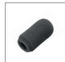
3M™ PELTOR™ Wind shield M171/2